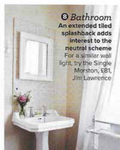
ⓐ Bathroom An extended tiled splashback adds interest to the neutral scheme. For a similar wall light, try the Single Morston, £81, Jim Lawrence

bathroom and converting the separate kitchen and dining room into one big space that opens out into the garden. 'The builders knocked down the wall that separated the two rooms and, as they had removed most of the back wall for the sliding glass doors, they had to put in a huge steel box frame to stabilise the back wall before the doors went in,' says Hannah. 'From the day the builders started to the day the kitchen worktop finally arrived took about eight weeks in total, which is not bad going. We also got someone in to do the garden decking as we were too tired by then to do it ourselves!'