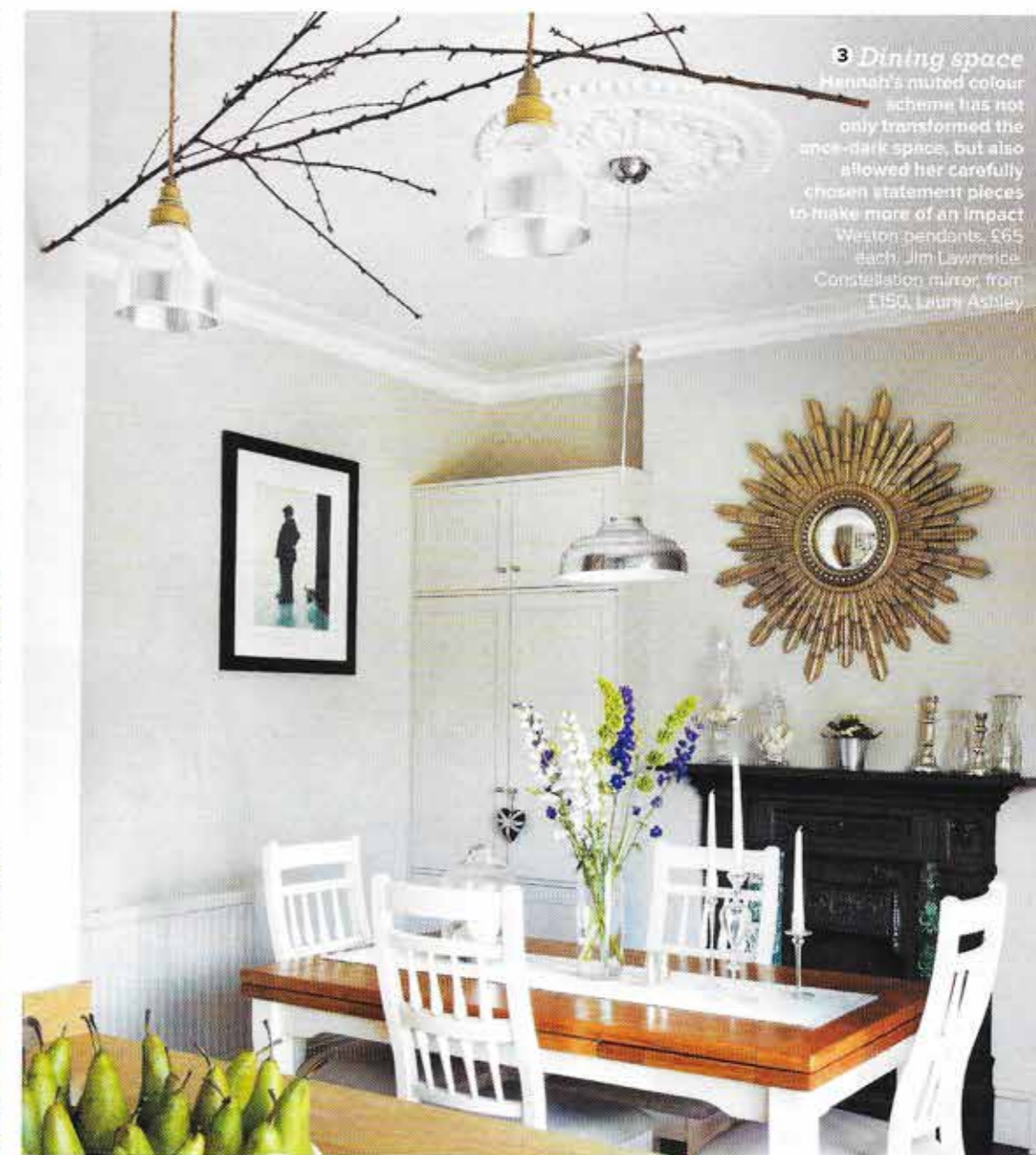
3 Dining space Hannah's muted colour scheme has not only transformed the once-dark space, but also allowed her carefully chosen statement pieces to make more of an impact. Weston pendants, £65 each; Jim Lawrence Constellation mirror, from £150; Laura Ashley

2 Garden room The garden has been completely re-landscaped with a decking area and gravel leading to the lawn beyond. The decked area becomes the family's main living space in the summer. 'It's great for our son Oliver,' says Hannah. For a similar sofa, try the Rattan effect sofa (part of a four-piece set), £599, Argos. For a similar planter, try the Geo Cube, from £79.99, Crocus