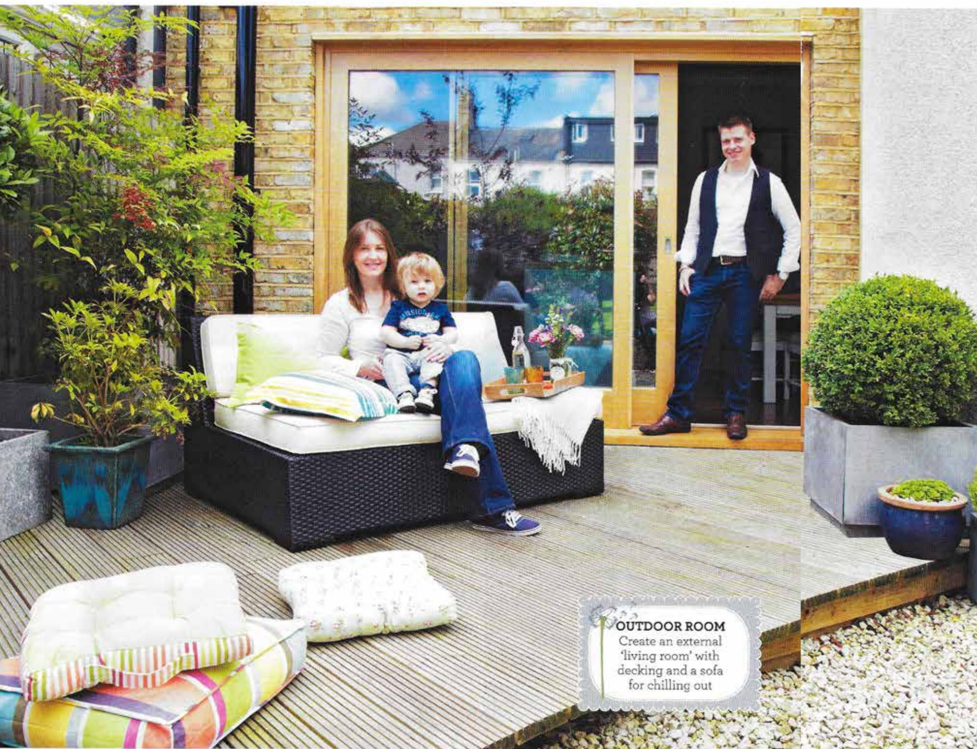
OUTDOOR ROOM Create an external 'living room' with decking and a sofa for chilling out