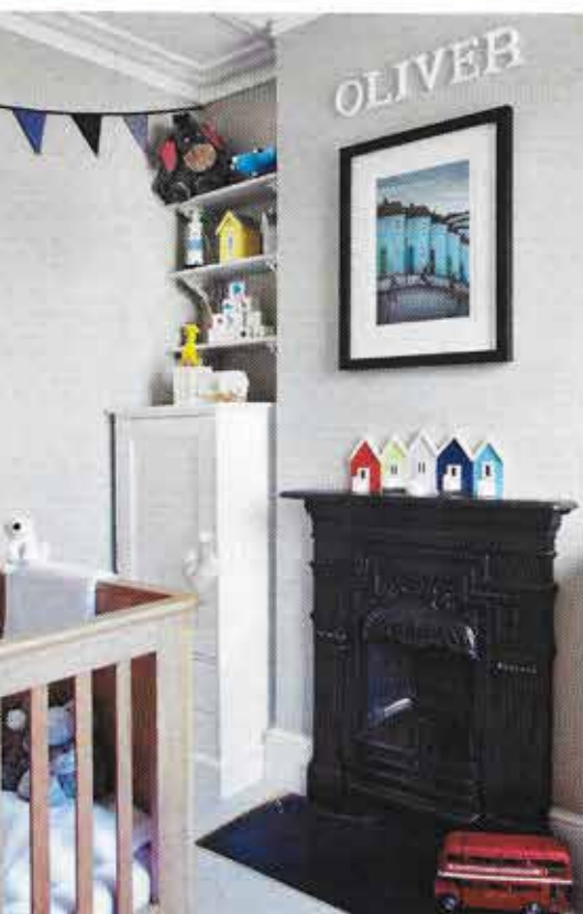
ⓑ Oliver's room The simple scheme is a classic that will work even when son Oliver is a teen. Old English 23cm Antique White wooden letters, £9.50 each, Posh Graffiti. Tin plate bus, £31.99, Tin Plate Collectables. Walls painted in French Grey Pale Absolute Matt Emulsion, £30.50 for 2.5ltr, The Little Greene Paint Company

'I did the wallpapering in here and I ended up painting the walls in the hall, right to the landing ceiling, up a 20ft ladder'